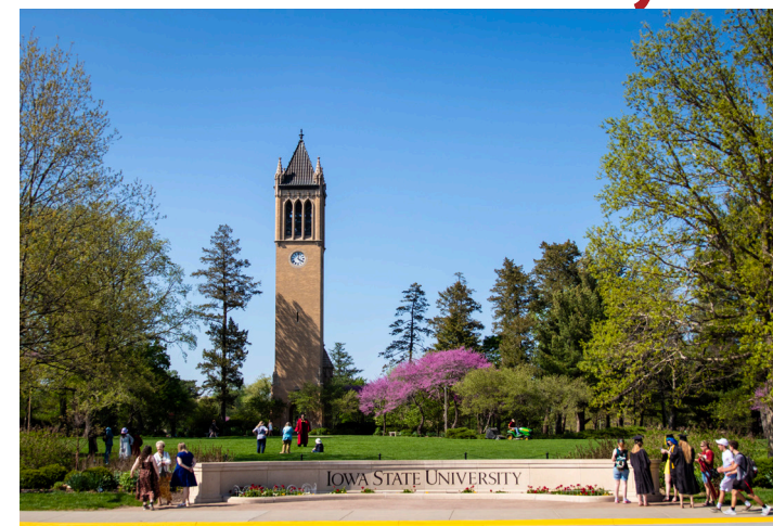
ISU is a beautiful backdrop to OMWF2024. Enjoy the campus and the welcoming community as you compete!