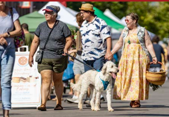
3. So many cute dogs