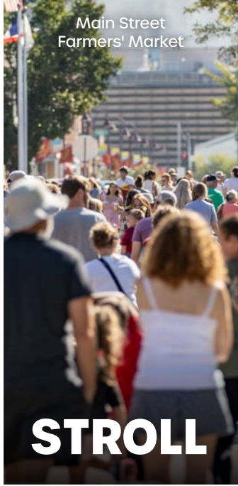
Main Street Farmers' Market