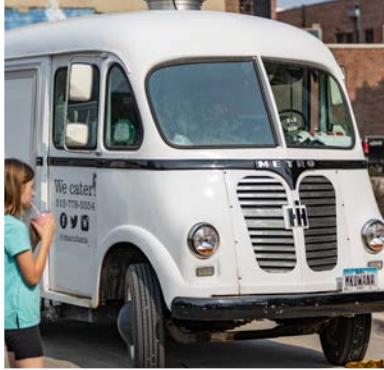
4. Food trucks