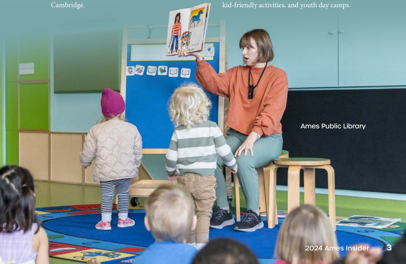
Ames Public Library

Check out this summer's garden playhouse exhibit, plus a secret children's garden, bugs and butterflies, kid-friendly activities, and youth day camps.